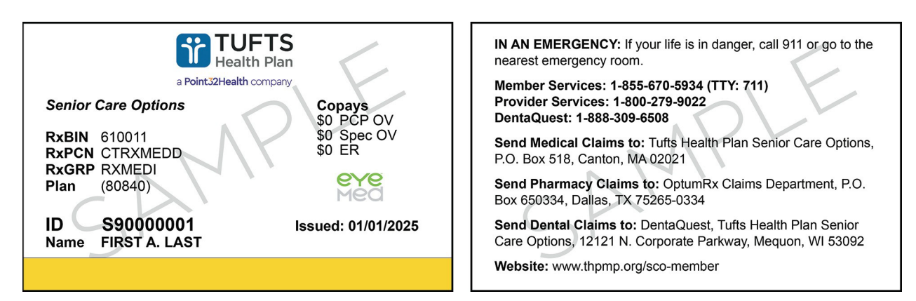
Senior Care Options sample ID card:

Do NOT use your red, white, and blue Medicare card for covered medical services while you are a member of this plan. If you use your Medicare card instead of your Tufts Health Plan Senior Care Options membership card, you may have to pay the full cost of medical services yourself. Note: Because you get assistance from MassHealth (Medicaid), you have no cost share for covered services when you use your membership card. Keep your Medicare card in a safe place. You may be asked to show it if you need hospital services, hospice services, or participate in Medicare approved clinical research studies also called clinical trials. If your plan membership card is damaged, lost, or stolen, call Member Services right away and we will send you a new card.